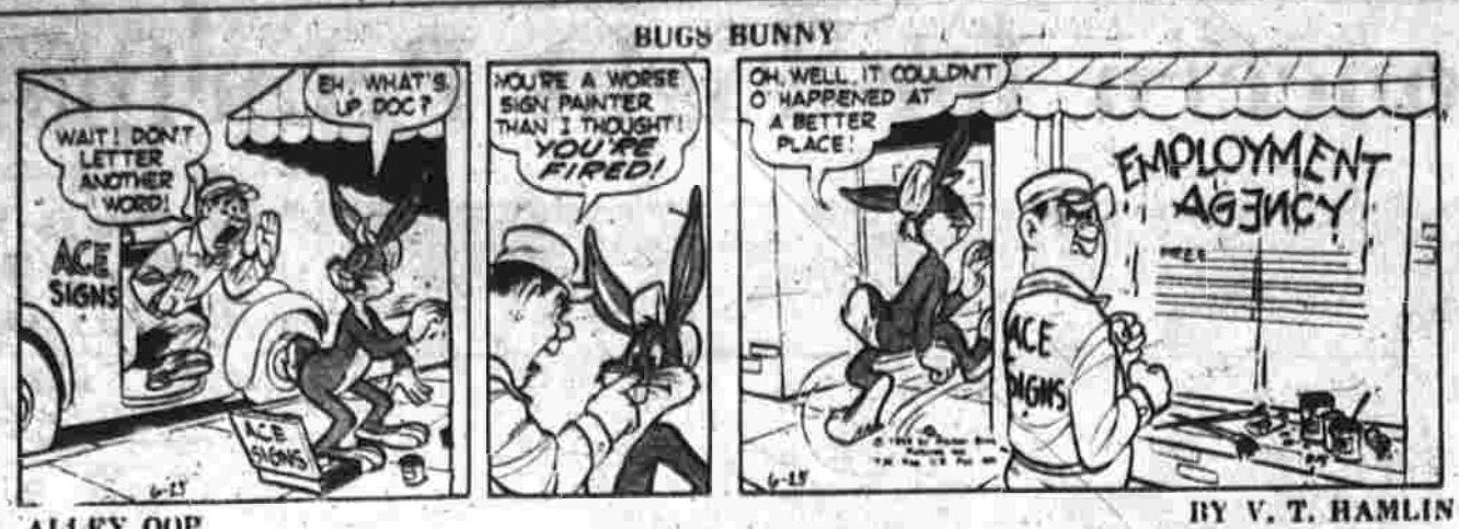
BUGS BUNNY BY V. T. HAMLIN