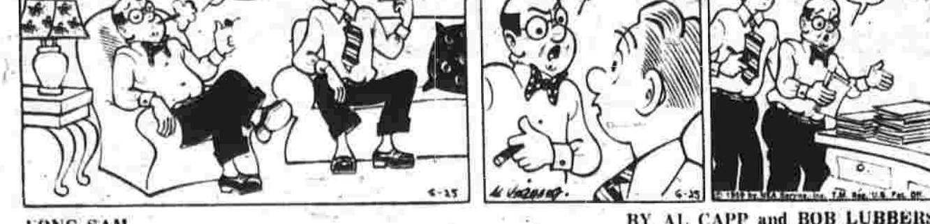
PRISCILLA'S POP BY AL VERMEER