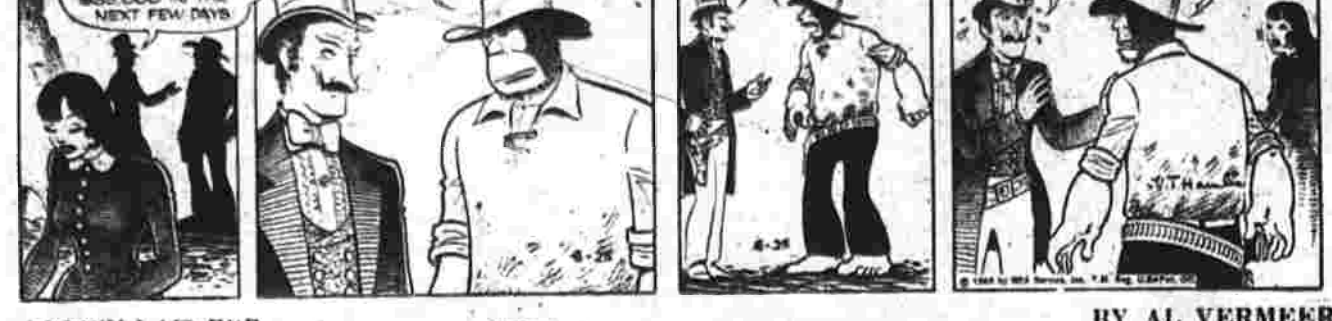
ALLEY OUP BY V. T. HAMLIN